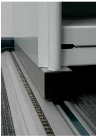
Low Profile Tracks

Mobile shelving systems maximise your storage area creating additional workspace. Eliminates multiples access aisles and passage ways.