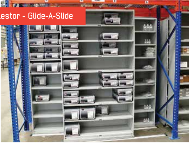
Filestor - Glide-A-Side