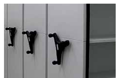
Mechanical Assist - Style 2