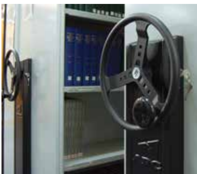
Mechanical Assist - Style 1

WE DESIGN, DELIVER AND INSTALL AT YOUR PREMISES